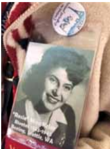
Do you remember Rosie the Riveter? She was the poster girl for WW II war industries. Seeing the young Rosie, and now the older one, was interesting.