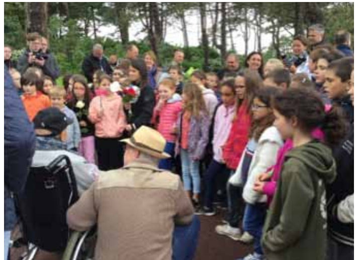
The "pied piper" was surrounded by fifty four of my ten year old French student's friends at Paul's cross.