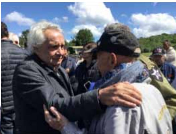
Talking with Michel Sardou, a popular French singer, songwriter, actor and decorated veteran was a real treat for me. His history is indeed interesting!