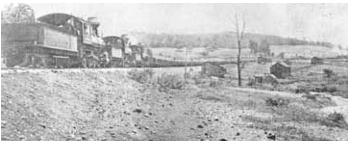
Railroad in Powelltown