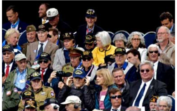
Our VIP seating on the platform was behind President Macron and Trump.